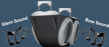
*Shown With Optional MG6-S Grilles & Optional QAP-B Brackets