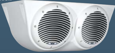
*Shown With Optional MG6-W Grilles

The Waves And Wheels QAP Quad Arch Pod Is Designed For Marine Radar Arches And Many Other Applications For Optimal Musical Dispersion Reaching Beyond 50yds Of The Bow And Transom Of The Vessel/Off Road Vehicle! The QAP Is UV Resistant And Made From LLPDE Polyurethane. The Unique 4 Way Design Not Only Gives An Even Musical Dispersion Throughout And Beyond The Boat, But Also Gives A Sleek Cosmetic Enhancement To The Arch Or Rollbar. Includes An EVA Gasket To Seal The Enclosure To The Arch.