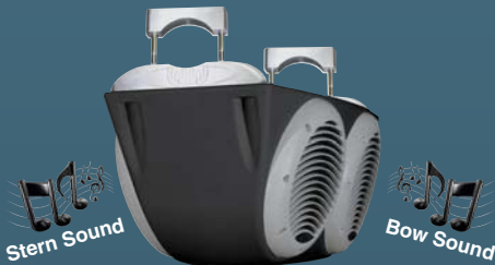
*Shown With Optional MG6-S Grilles & Optional QAP-B Brackets