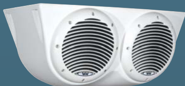
*Shown With Optional MG6-W Grilles

The Waves And Wheels QAP Quad Arch Pod Is Designed For Marine Radar Arches And Many Other Applications For Optimal Musical Dispersion Reaching Beyond 50yds Of The Bow And Transom Of The Vessel/Off Road Vehicle! The QAP Is UV Resistant And Made From LLPDE Polyurethane. The Unique 4 Way Design Not Only Gives An Even Musical Dispersion Throughout And Beyond The Boat, But Also Gives A Sleek Cosmetic Enhancement To The Arch Or Rollbar. Includes An EVA Gasket To Seal The Enclosure To The Arch.