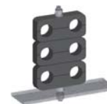
CB-600T Shown with HK-TSCB