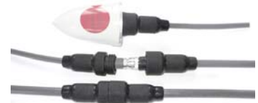
IPB™ Weather Seal Boot System