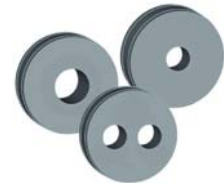
SC-900T-1 SC-600T-2 SC-600T-1