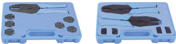
RFA-4005 Crimp Handle & 2 Dies

*Includes RFA-4005-01 & RFA-4005-02 Dies - For RG58/U, RG59/U, RG142/U, RG223/U, RG400/U, RG-8X, Proflex, RG8/U, RG213/U, RG-214/U