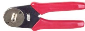
RFA-4089 Crimp Tool For Miniature & D-SUB