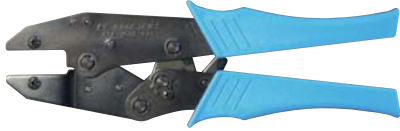
RFA-4005-20 Crimp Handle Only - No Die