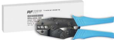
RFA-4005-300 RFA-4005-02 Die With Handle