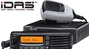
Shown with optional Front Panel Detach Kit

Output Power: 50w VHF; 45w UHF Frequency: 136-174 / 450-520 Channel Spacing: 12.5kHz Channel Spacing: 2.5, 3.125 Mil Spec: 810 C, D, E Scan: Normal/Priority/Dual PC Programmable: Optional Software & Cable Includes: HM148 Microphone